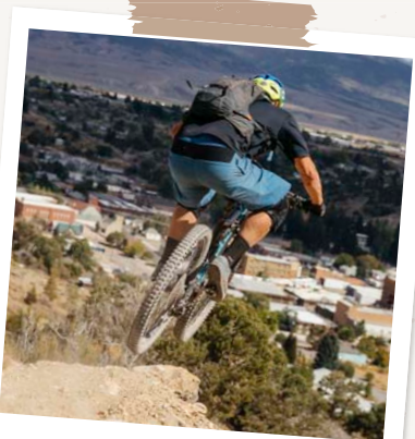
Squaw Peak Trails

Steam trains have shuttled passengers throughout the west for over a century. So has the bicycle! Now you can enjoy having you and your bike shuttled to the end of the line by the Nevada Northern Railway National Historic Monument during any regular scheduled train and ride one of many routes back to town at your own pace with the brand new "Trains and Trails Ticket".